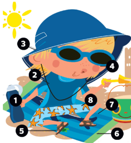
Illustration by Delicatessen